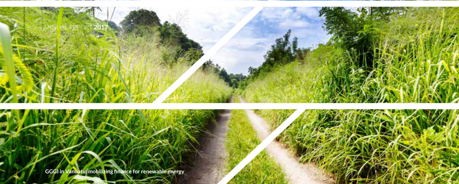
GGGI in Vanuatu: mobilizing finance for renewable energy

In 2017, GGGI delivered 160 capacity building activities. The participants benefited from knowledge and skills transfer and skills development which enhanced Member and partner countries capacity to develop and implement green growth policies, investments and project implementation. For projects that collected participation rates by gender, the overall participation rate was 41% female and 59% male. Of the 2017 activities, 37% of capacity building events involved sharing of lessons from other countries.